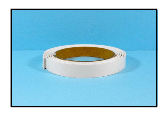
Fast, easy to use! Can be painted immediately!